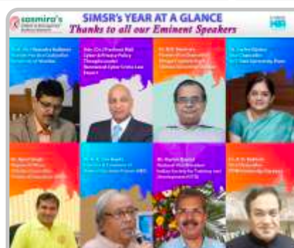
Vice Chancellors and Corporate Heads as Chief Guest and Guest of Honor